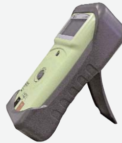
EZ 100 shown with standard A101 tilt stand protective boot

EZ 100 Comes Complete With: (2) A002 1.5V Battery, A040 Test Lead Set, A101 Rubber Boot